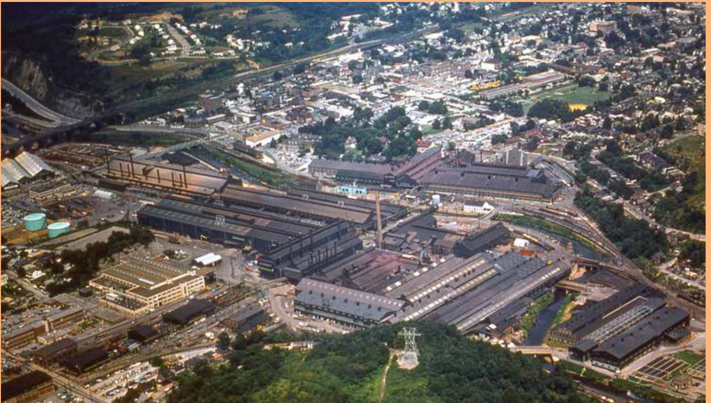
A 1970s aerial view of Coatesville and Lukens Steel Company. Spot the group of trees in the center of the photograph...note the Lukens Main Office building just to the left and the Employee Store just to the right.